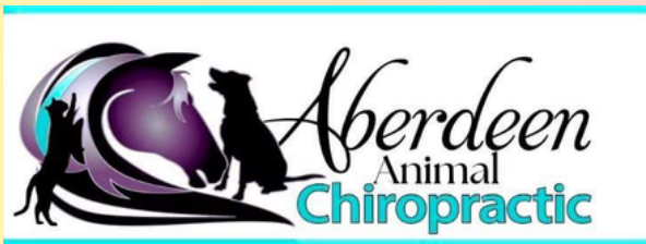
Aberdeen Animal Chiropractic